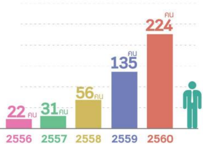
Number of Researchers (2013-2017)